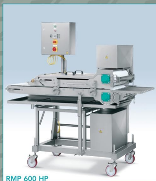
RMP 600 HP