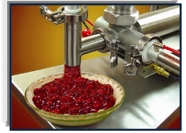
Drip Free Nozzle