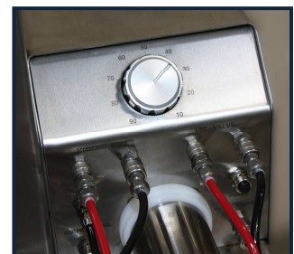
Deposit Speed Dial