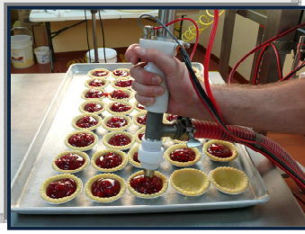
Hand Held Nozzle