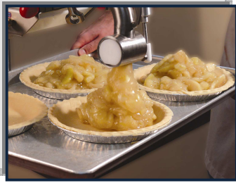
Rotary P.C Nozzle