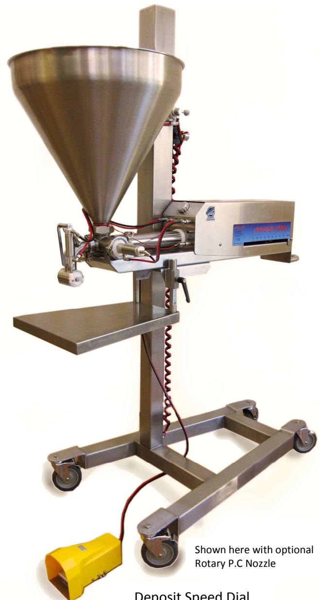
Shown here with optional Rotary P.C. Nozzle